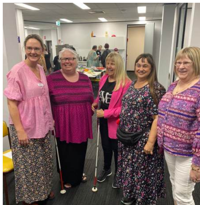
Image of four women peers

* Other mentoring includes information about the NDIS, linking to other organisations and activities, mentoring in podcasting and many more.