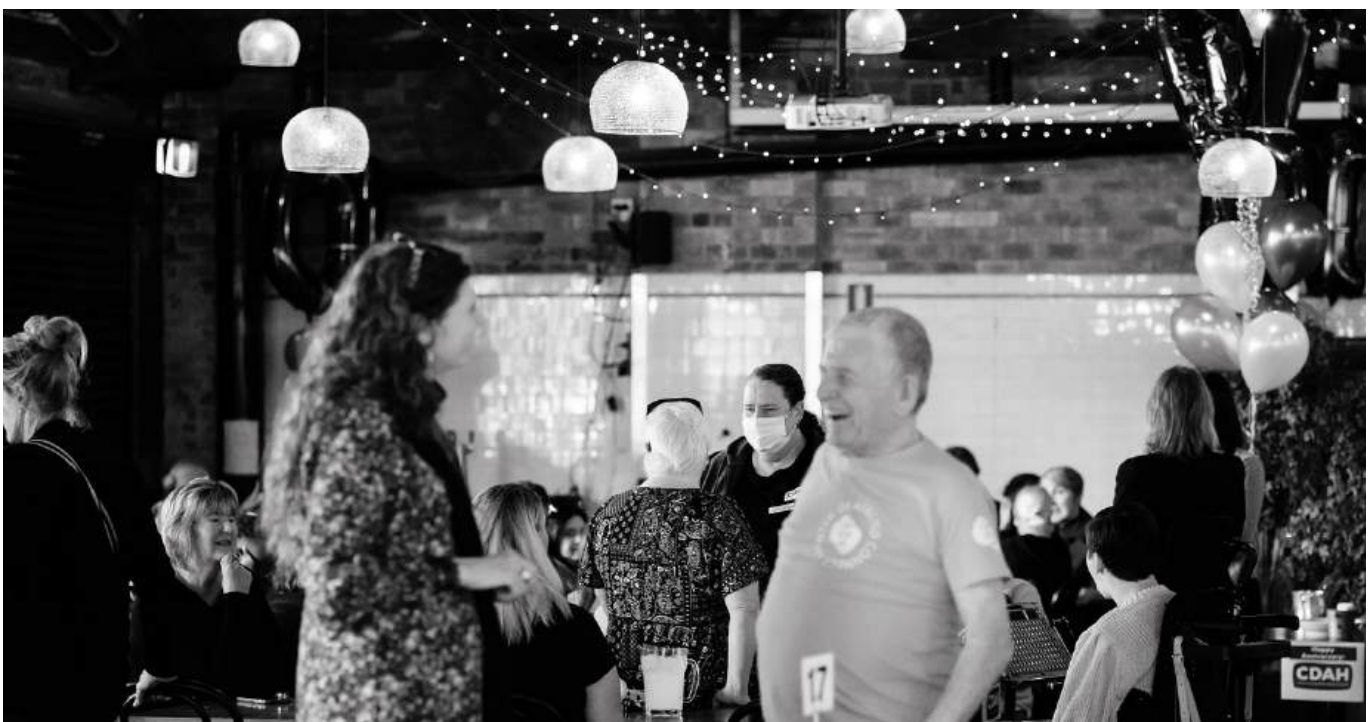
Image of CDAH Peers celebrating, talking and smiling in the pub

Looking ahead, the next year, the CDAH Events Team plans to continue to celebrate and support our peers with more events and activities.