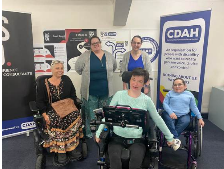
Image of a group trained Peers with the trainers

This year only brought positive changes to Learning Hub