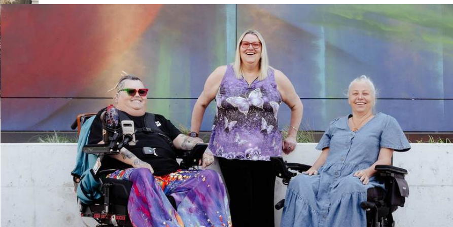
Image below, members of the Koori Peergroup