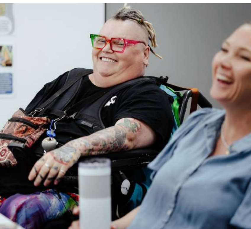
Image of two peers laughing

Thank you Community Connections team for all of the amazing connecting that you have done and are continuing to do.