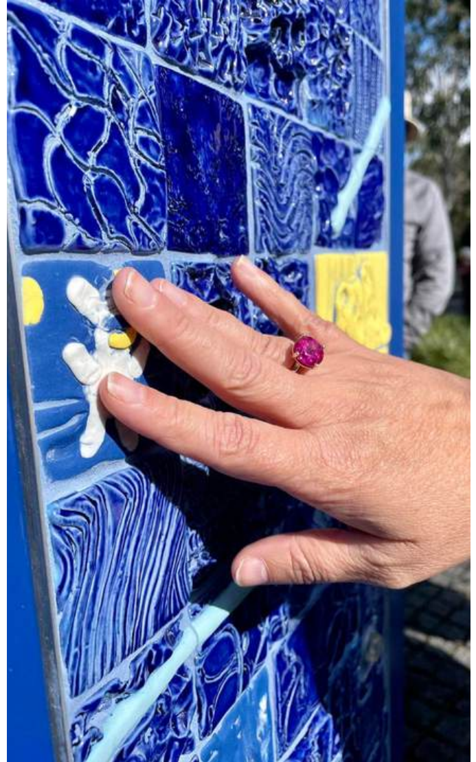
Image tactile artwork created in collaboration with Lake Macquarie Council

Work is currently under way to support a Deafblind Hub in the Sydney area to meet the needs of the Deafblind community in this area.