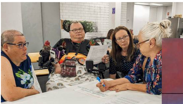
Image of a group of women sitting at a table writing and thinking

On International Day of Disability 3rd December 2024 we will host a live reading/performance event in collaboration with Hunter Writers' Centre, to be a hybrid event - both in-person and on zoom. Both these events will be free of cost to participants. The editing workshop is an opportunity to develop a piece you might like to share at the International Day of Disability event.